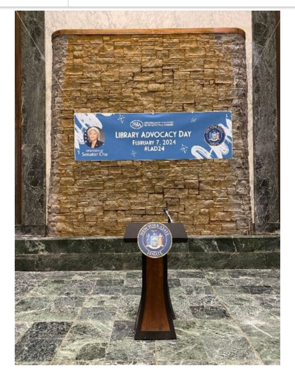
The view of the "well" early morning on Library Advocacy Day!