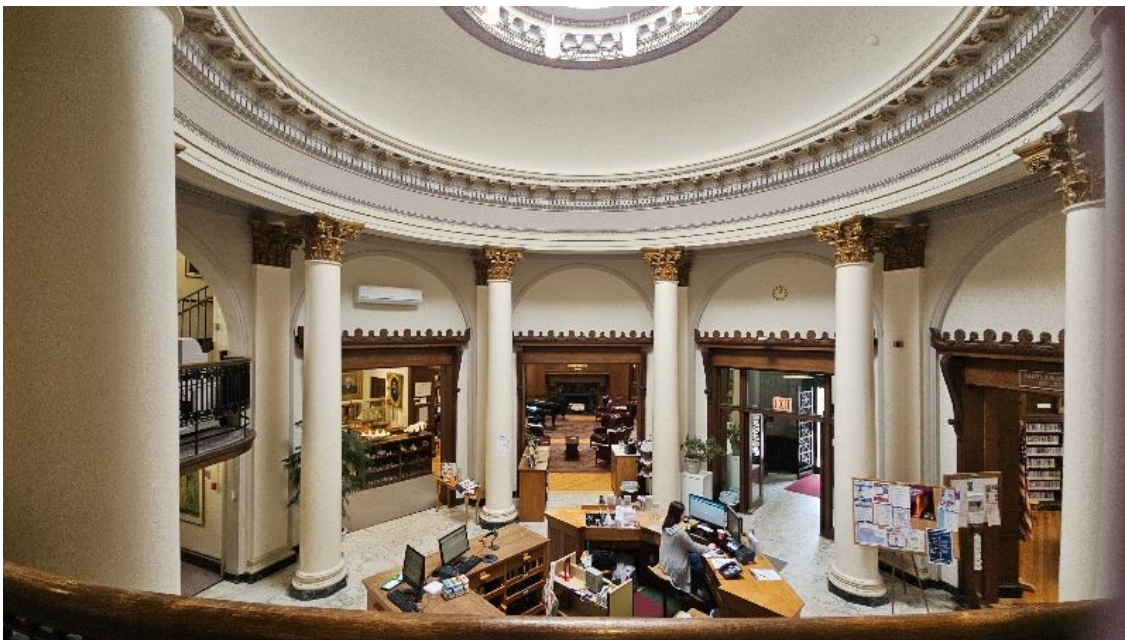
The interior of the Patterson Library located in Westfield, NY.