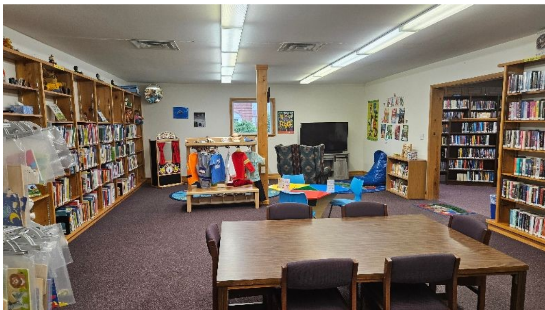
The children's room at Seneca Nation of Indians Cattaraugus Library.