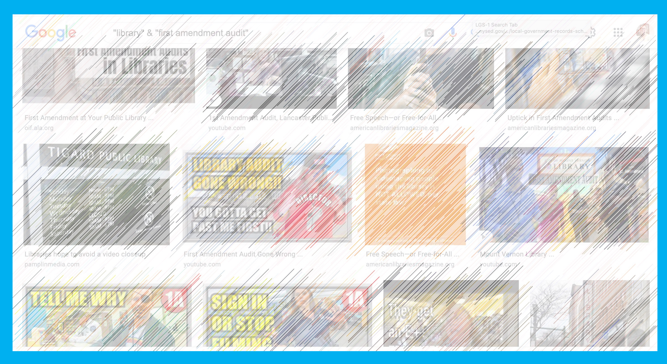
Blurred image of search results for "library first amendment audits"