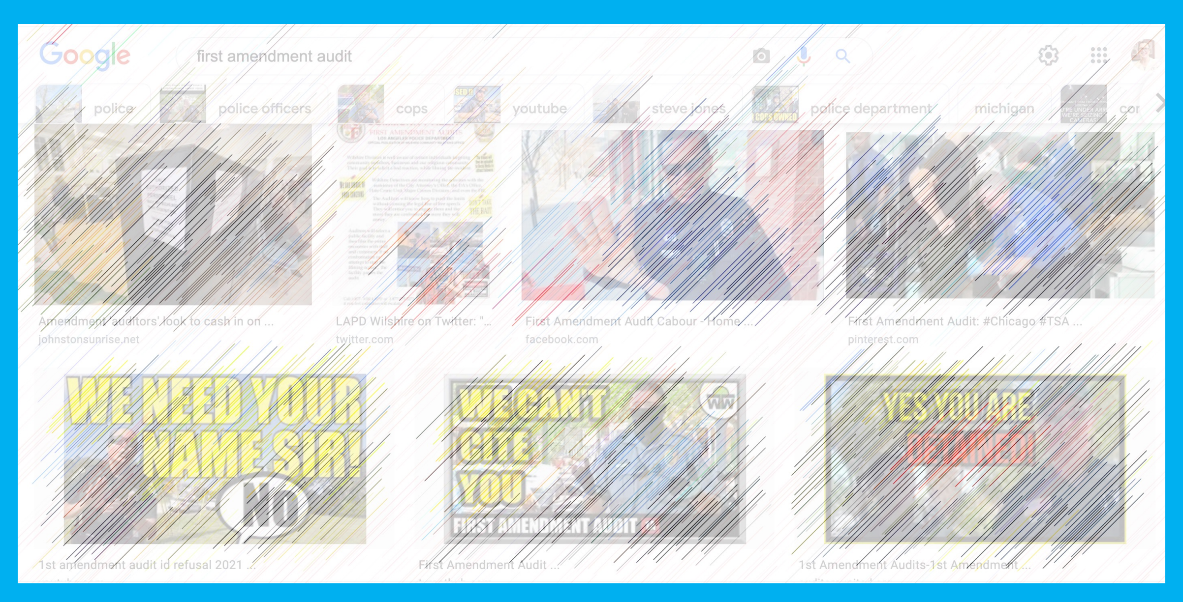
Blurred image of search results for "first amendment audits"