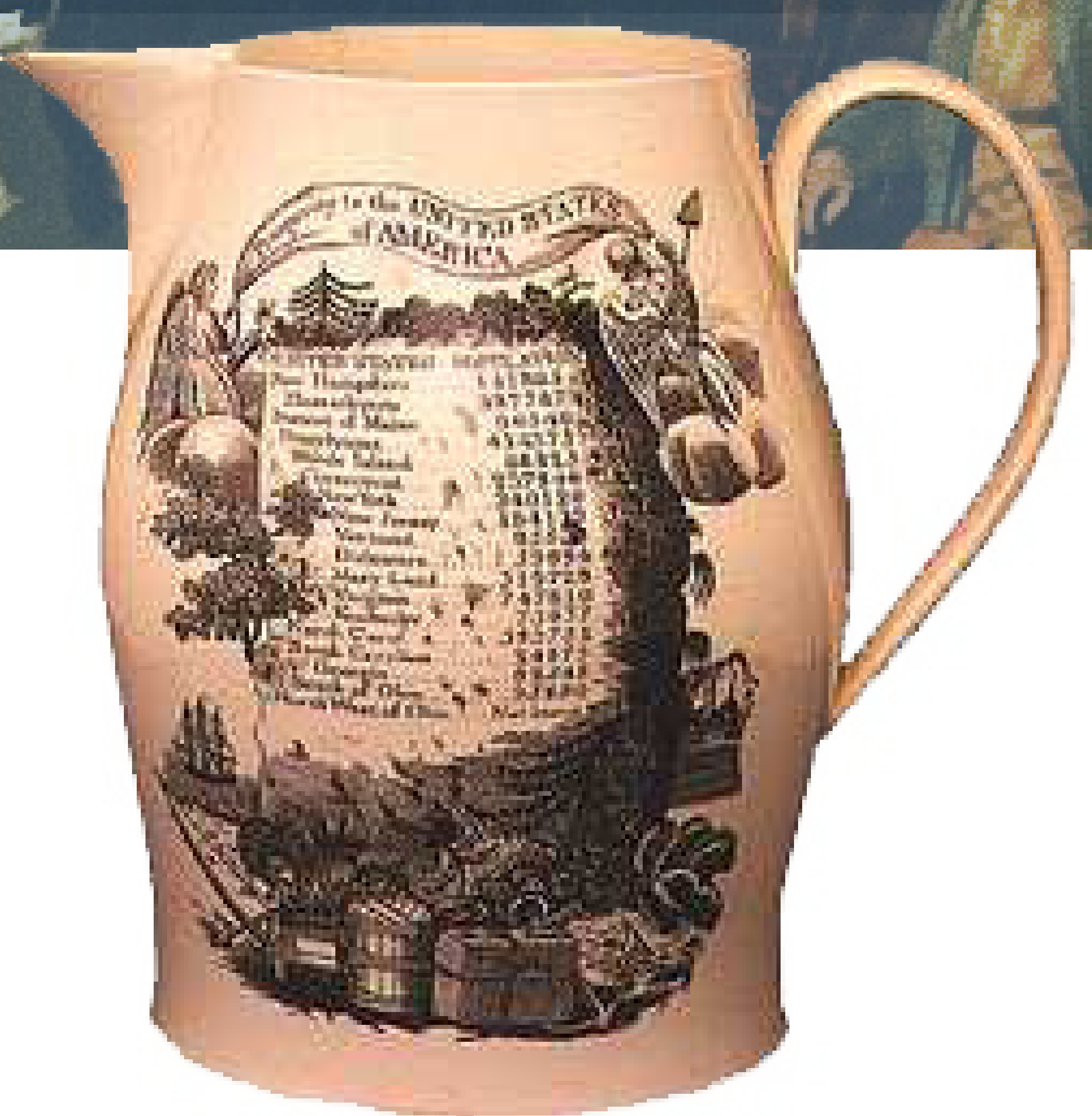
Made in England for the American market, this creamware jug commemorates the first census of the United States taken in 1790.